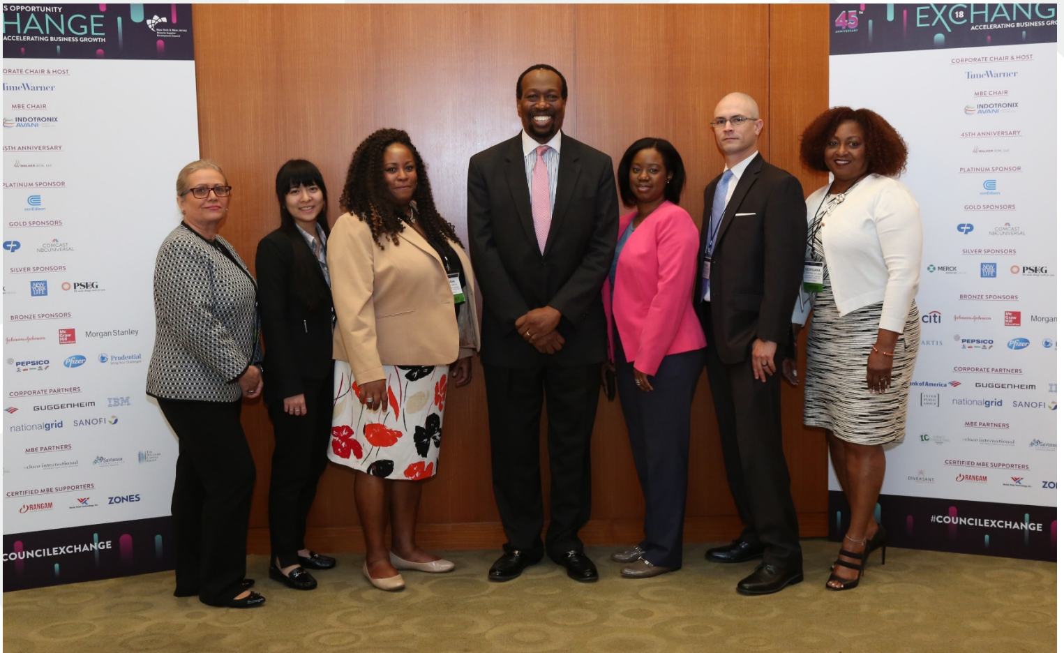
Business Opportunity Exchange 2018